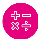
Viscosity Density Flow Temperature