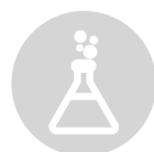
Customized additives recipes