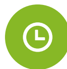
Preparation times reduction