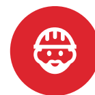
Elimination of human error